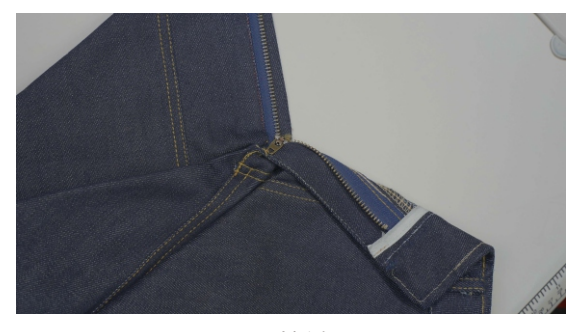
上拉链 Sew a zipper