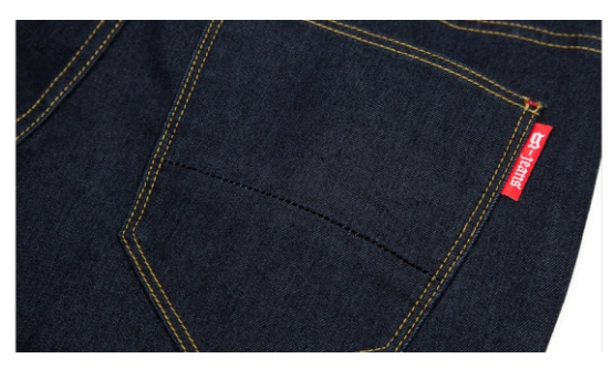
缝口袋 Sew pockets