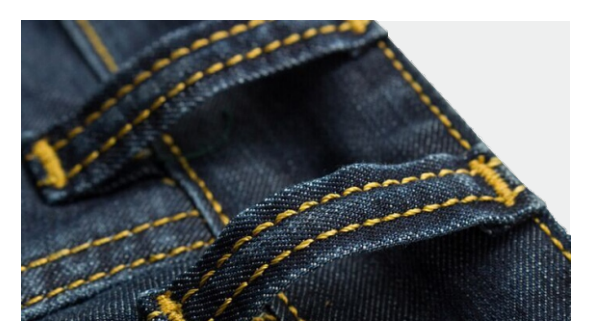
钉裤袢 Sew loops on trousers