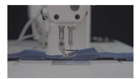
连续过梗不断线 Uninterrupted line while passing the stalk continuously